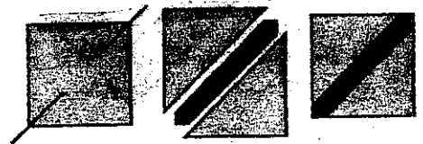
Stem Unit Assembly Diagram